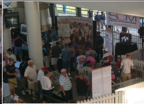
Josh Gibson Traveling Exhibit Featured at Hall of Fame Heritage Weekend with the Cleveland Indians August 2010